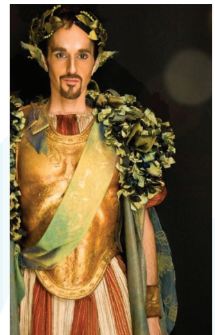
as Orlando/Lunaire with Opera Erratica (left) and as Oberon in Midsummer Night's Dream with Banff Festival of Arts (right)