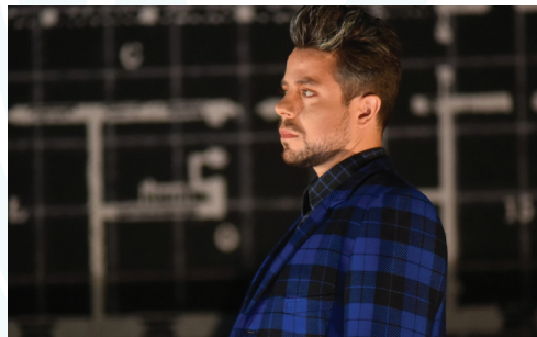
as Cartier in Louis Riel with Canadian Opera Company