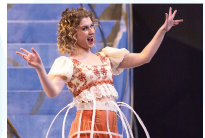
as Hermia in A Midsummer Night's Dream with Vancouver Opera