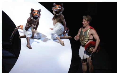
as Caesar in Young Caesar with Los Angeles Philharmonic

Serenade for Tenor, Horn and Strings Britten | Thirteen Strings, Ottawa Elijah Mendelssohn | Vancouver Bach Choir Messiah Handel | National Arts Centre Orchestra, Ottawa Salute to Vienna Saskatoon Symphony/Vancouver Symphony